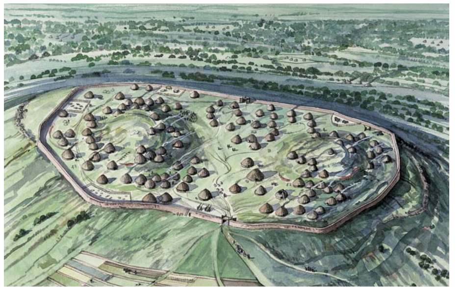
Reconstruction of Yeaving Bell in about 2000BC by ©Eric Delle.

This is the largest hillfort in Northumberland, a land rich in hillforts. These high defensible settlements were a feature of Iron Age life. But why were they built? Who did the builders seek protection from? Or was the site as much to do with prestige as protection?