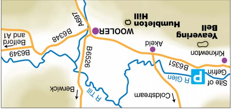
How to reach Yeaving Bell

Rothbury Visitor Centre 01669 620887 Ingram Visitor Centre 01665 578890 Traveline 0870 6082608 Allow at least 3 hours to complete this 3.5 mile (5.5km) walk. Some of the walking is strenuous, with a very steep descent, and the top is very exposed in poor weather. Wear good walking boots and take warm waterproof clothing with you. Please park at the Gefrin monument lay-by or the grass verge indicated on the route map. Useful map: OS 1:25,000 'The Cheviot Hills' (OL16 in the Explorer Series) This product includes mapping data licensed from Ordnance Survey © Crown Copyright 2006. License number 100022521